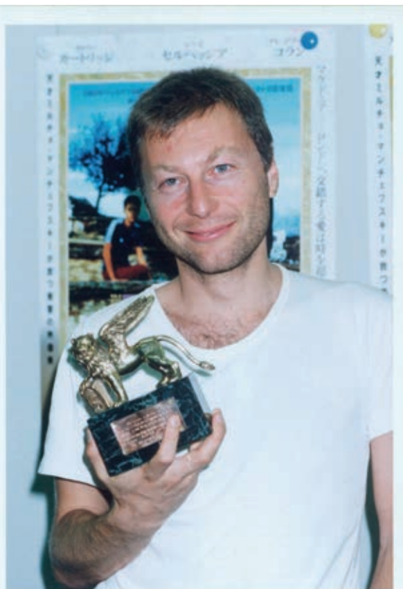
Со Златниот лав на Курасава