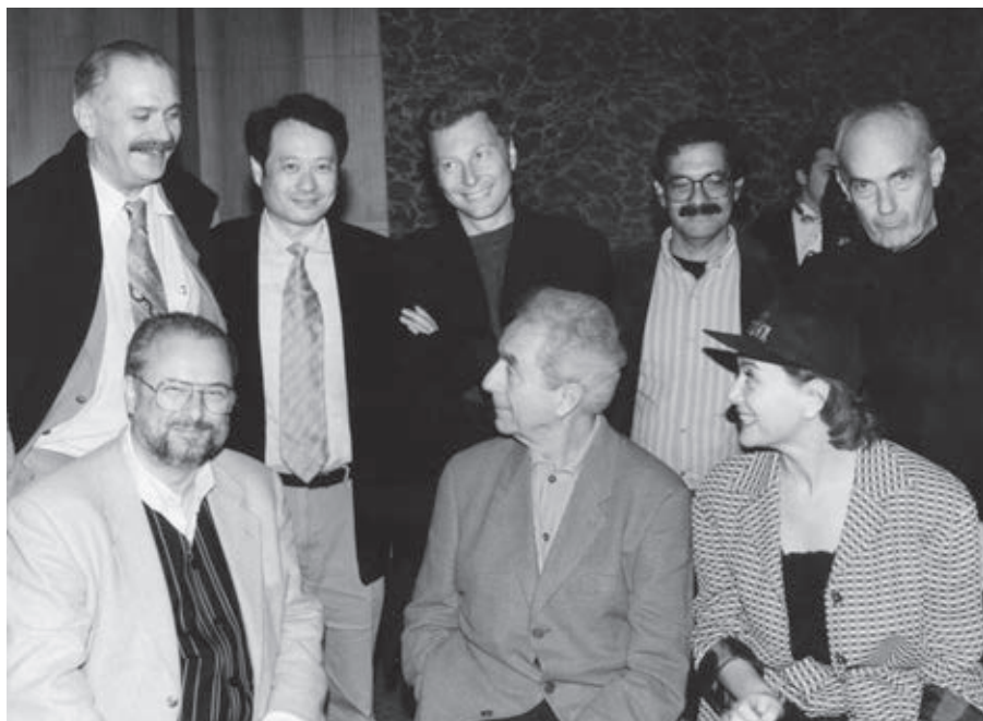
Манчевски со колегите номинирани за Оскар Никита Михалков, Анг Ли, Жерар Корбио, Томас Гутиерес Алеа и Хуан Карлос Табио со Микеланџело Антониони