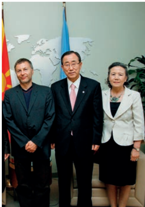
Со Бан Ки-мун, Генерален секретар на ОН