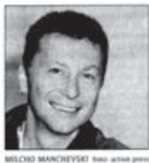
MILCHO MANCHEVSKI

Und wenn sich die großen Pläne nicht realisieren lassen? Manchevski lacht: „Dabei bin ich wieder Filmemacher, aber mit Musik, die ich mag. Wie zum Beispiel die Rolling Stones – Nasser Farsi, Ali Khan oder Mozart.“